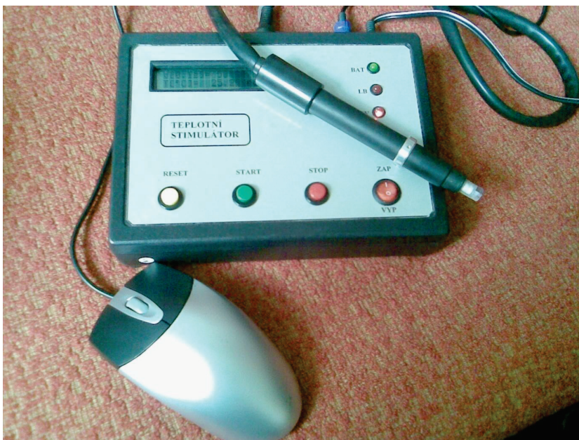
Fig. 1. The thermal stimulator device.

C N: control subjects without body modifications measured in neutral settings; BM N: subjects with body modifications measured in neutral settings; C HP: control subjects without body modifications measured at a Hell Party; BM HP: subjects with body modifications measured at a Hell Party; F: female; M: male. Data are presented as Mean ± SD.