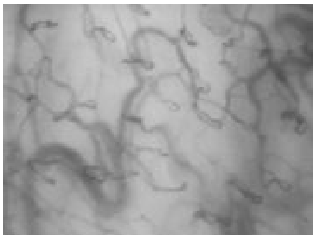
Fig. 3. Sublingual microcirculation by OPS imaging

perfusion in a tissue and also an indirect measure of oxygen delivery. The most easily accessible site in man is the mouth, where OPC produces excellent images of the sublingual microcirculation. There is only weak correlation ( r=0,13 ) between the microvascular flow index calculated from paired OPS imaging in the sublingual region and in teeth (Boerma et al. 2005). De Backer et al. (2002) demonstrated that the sublingual microcirculation in patients with severe sepsis and septic shock was markedly altered and these alterations were more severe in non-survivors. The improvement of microcirculatory alterations in the first 24 h of resuscitation was found to be a better predictor of the outcome than changes in cardiac index, blood pressure or lactate (Sakr et al. 2004). OPS imaging was used as an objective bedside method for monitoring effect of the treatment on microcirculatory perfusion, the passive leg