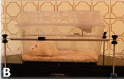
Fig. 1. Apparatuses for two of the tests used to examine behavioral sensitization in rats. (A) The Laboras Test which examines animal activity in unknown environment. an Conditioned Place (B) The Preference Test which examines drug-seeking behavior based on conditioning.